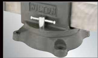
4 MOUNTING POSTS